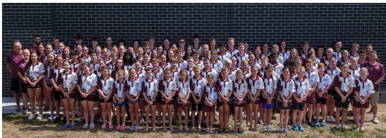
Gippisland Championships Winning Team 2025

A general guide for members of the Traralgon Swimming Club including Club history, mission, annual organisation and activities and policies.