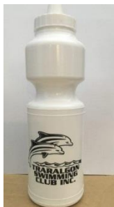
Drink Bottles $6

All Uniform items are ordered online www.traralgonswimming.org.au