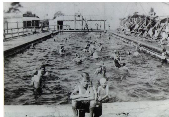
OLD TRARALGON BATHS Approx 1939