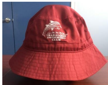
Sun Smart Bucket Hats $15

Other items - personalised caps, coats, hoodies and bathers are available from time to time. Inquire through the clothing officer regarding these items.